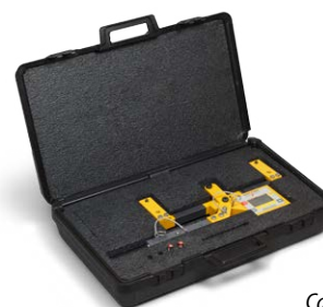
Carry case included