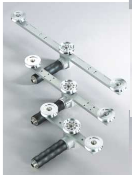
Tritens® Standard versions