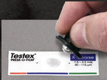
For use with Testex® Press-O-Film® Replica Tape

Measures and records surface profile parameters using replica tape