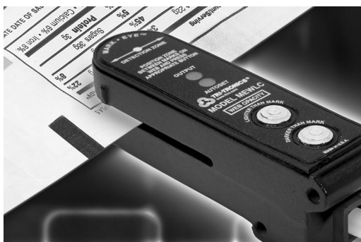
Dark Mark on a Light Web (Figure A)