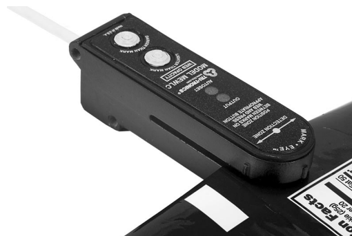
Light Mark on a Dark Web (Figure B)