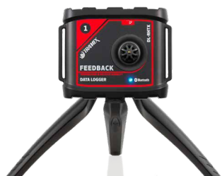
Product code: DL-RHTX