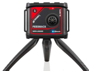
Product code: DL-RHTX