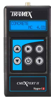
Product code: CMEX2