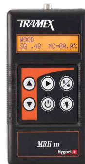
Product code: MRHIII