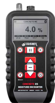
Product code: CMEX5

The Hygro-i2 ® probe is used with the CMEX5, Feedback DataLogger DL-RHTX, CMEX II or the MRH III for relative humidity testing of flooring slabs and ambient conditions. The Hygro-i2 ® probe is used to carry out insitu RH tests (ASTM F2170) and hood RH tests (British Standards 8201, 8203).