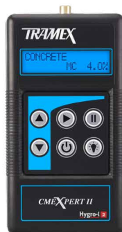
Product code: CMEX2