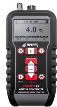
Product code: CMEX5

The Hygro-i2 ® probe is used with the CMEX5, Feedback DataLogger DL-RHTX, CMEX II or the MRH III for relative humidity testing of flooring slabs and ambient conditions. The Hygro-i2 ® probe is used to carry out in situ RH tests (ASTM F2170) and hood RH tests (British Standards 8201, 8203).