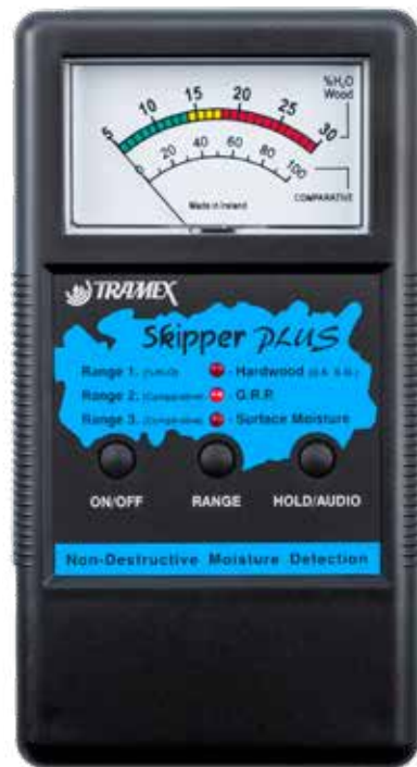
Product Code : SMP

Osmosis, also known as Gelcoat Blistering, is found in GRP hulls when moisture soaks into the hull surface, collects between the glassfibre and plastic laminate, resulting in blistering of the gelcoat. Usually found on or below the waterline, Osmosis dramatically reduces the structural strength of the hull and the value of a boat.