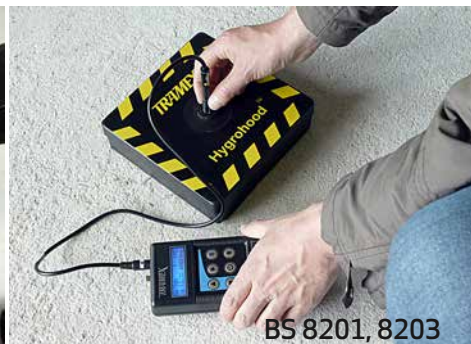
BS 8201, 8203