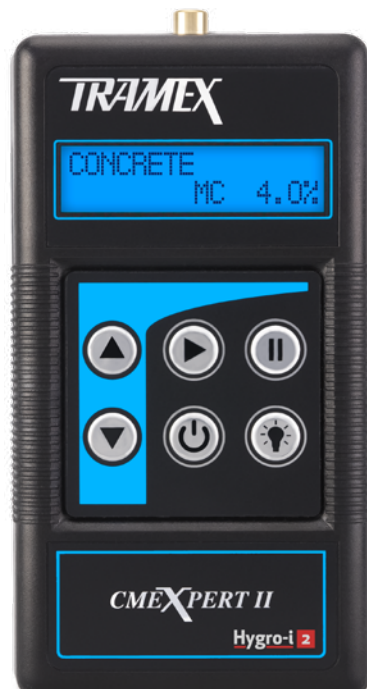
Product order code: CMEX2

Instant and non-destructive moisture content tests per ASTM F2659 with the CMEX II, a digital version of the CME4 handheld electronic moisture meter, designed for the instant and precise measurement of moisture content in concrete slabs and giving comparative readings in other cementitious floor screeds. Incorporating plug-in ports for the optional Hygro-i2 ® relative humidity probe and heavy-duty pin-type wood probes, this meter transforms into the ideal all-in-one instrument for the flooring professional.