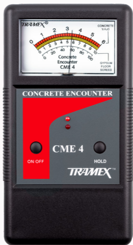
CME4 concrete encounter