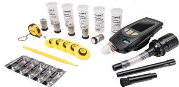
PosiTector CMM IS Pro Kit includes the PosiTector DPM Advanced

Replacement chambers, salt solutions, tools, caps, stackable probe extensions, and fins are available upon request