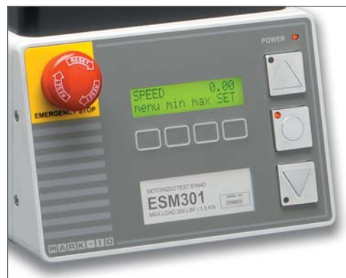
Digital controller contains a backlit LCD screen with menu choices for ease of setup and operation

Facilitates safe mounting to a work bench. Consists of a set of mounting adapters, and four sets of hardware with Allen key to accommodate surfaces of various thickness.