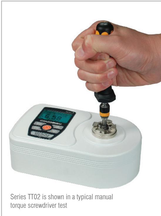
Series TT02 is shown in a typical manual torque screwdriver test

Series TT02 Torque Tool Testers present a simple and accurate solution for testing manual, electric, and pneumatic torque screwdrivers, wrenches, and other tools. These testers are compact and rugged, suitable for production environments. A universal 3/8" square receptacle accepts common bits and attachments. The TT02 captures peak torque in both measurement directions, and also calculates 1st and 2nd peaks, useful for click-type tools.