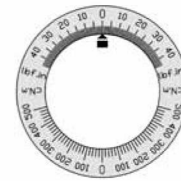
American & S.I. scales