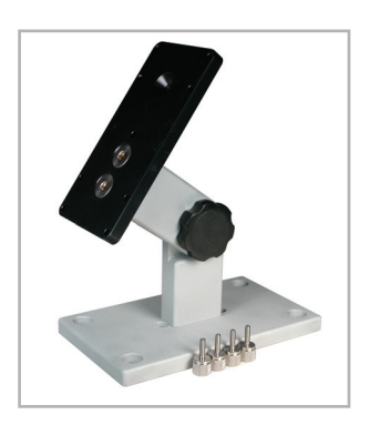
Optional AC1008 tabletop mounting stand

MESUR Lite data acquisition software is included with Series TT03 gauges