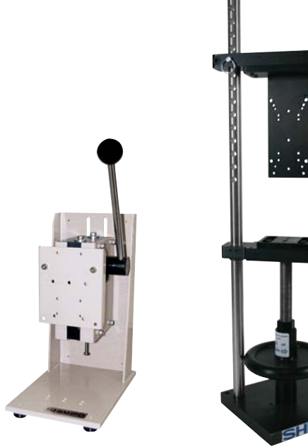
FGS-50S Lever Test Stand