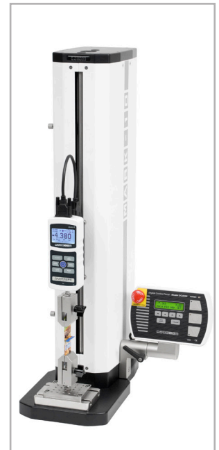
Shown with an ESM303 test stand and G1008 film & paper grips

Series 4 gauges include MESUR® Lite data acquisition software. MESUR® Lite tabulates continuous or single point data from Series 5 and 4 gauges. Data saved in the gauge's memory can also be downloaded in bulk. One-click export to Excel button easily allows for further data manipulation.