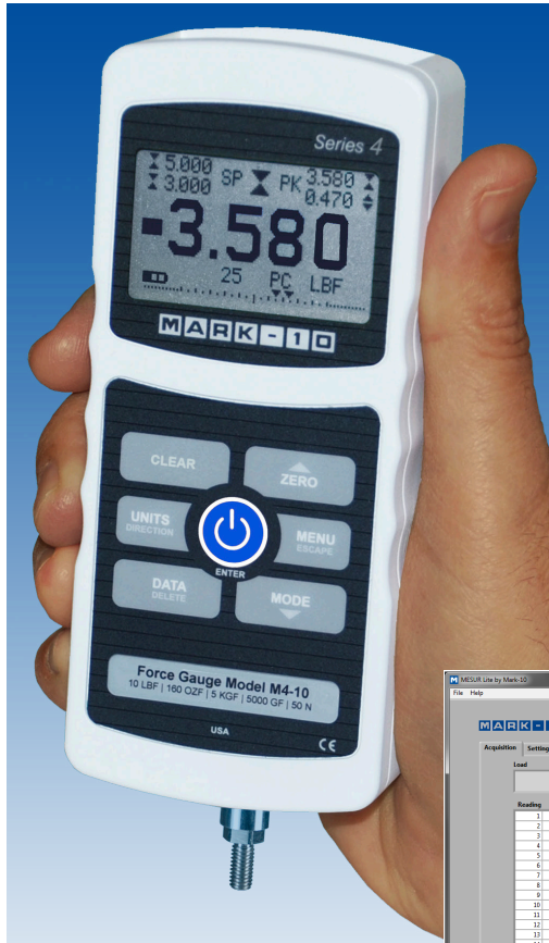
MESUR® Lite data acquisition software is included with Series 4 gauges