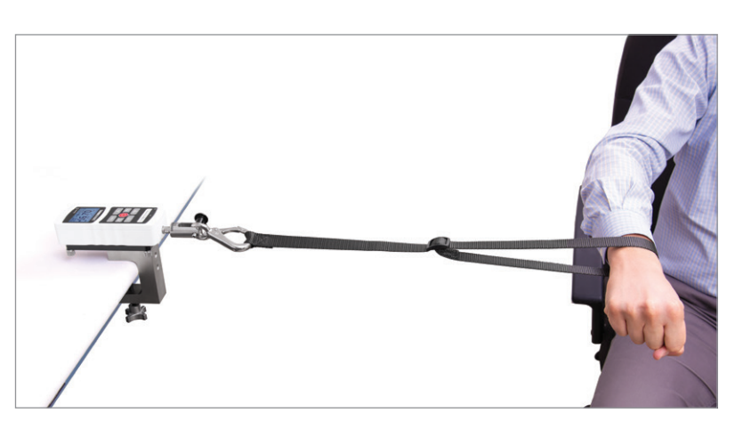
Force gauge shown in a horizontal orientation