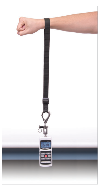
Force gauge shown in a vertical orientation

The Model EKM5-200 Myometer Kit facilitates a wide range of strength assessments and ergonomics studies. Featuring a Series 5 force gauge with 200 lbF (1,000 N) range, tabletop mount, strap, and accessories, this kit is ideal for ergonomists and other professionals.