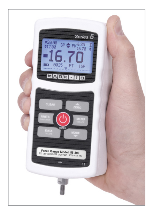
Force gauge displays real time force reading, peak force, and pass/fail indicators. The load cell shaft may be oriented in the up or down position, as demonstrated in the images below.