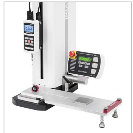
Shown with an ESM303 test stand and G1086 COF fixture

The M5-2-COF includes MESUR™ Lite data acquisition software. MESUR™ Lite tabulates continuous or single point data. Data saved in the gauge's memory can also be downloaded in bulk. One-click export to Excel easily allows for further data manipulation.