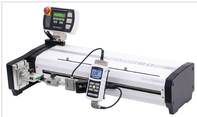
^ ESM303H is shown above configured for a peel test, with a Model M7i indicator, Series R01 load cell, and G1008 film and paper grips.

The ESM303H is a highly configurable horizontal force tester for tension and compression measurement applications up to 300 lbF [1.5 kN], with a rugged design suitable for laboratory and production environments. Sample setup and fine positioning are a breeze with available FollowMe™ force-based positioning - using your hand as your guide, push and pull on the load cell to move the crosshead at a variable rate of speed.