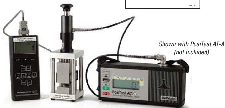
Shown with PosiTest AT-A (not included)