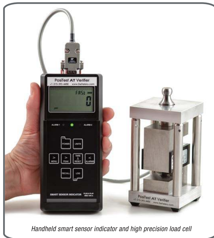
Handheld smart sensor indicator and high precision load cell