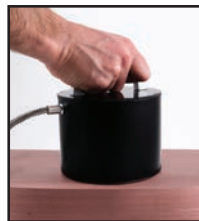
PosiTector 6000 FNGS

Compatible with PosiTector bodies with serial numbers greater than 700,000 and the PosiTector SmartLink.