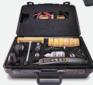
Complete Kit shown