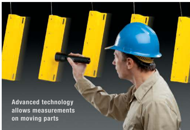
Advanced technology allows measurements on moving parts