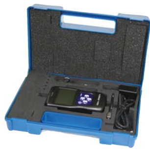
FG-3000 with Accessories in Protective Carrying Case