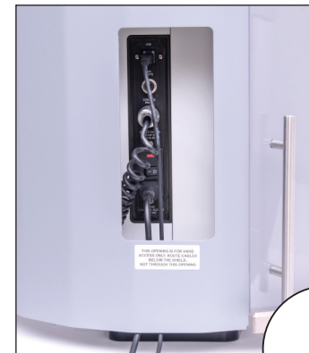
Fig. 3 Proper cable routing