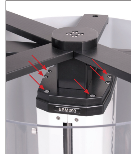
Fig. 1 Attaching the shield assembly to the ESM303 test stand column