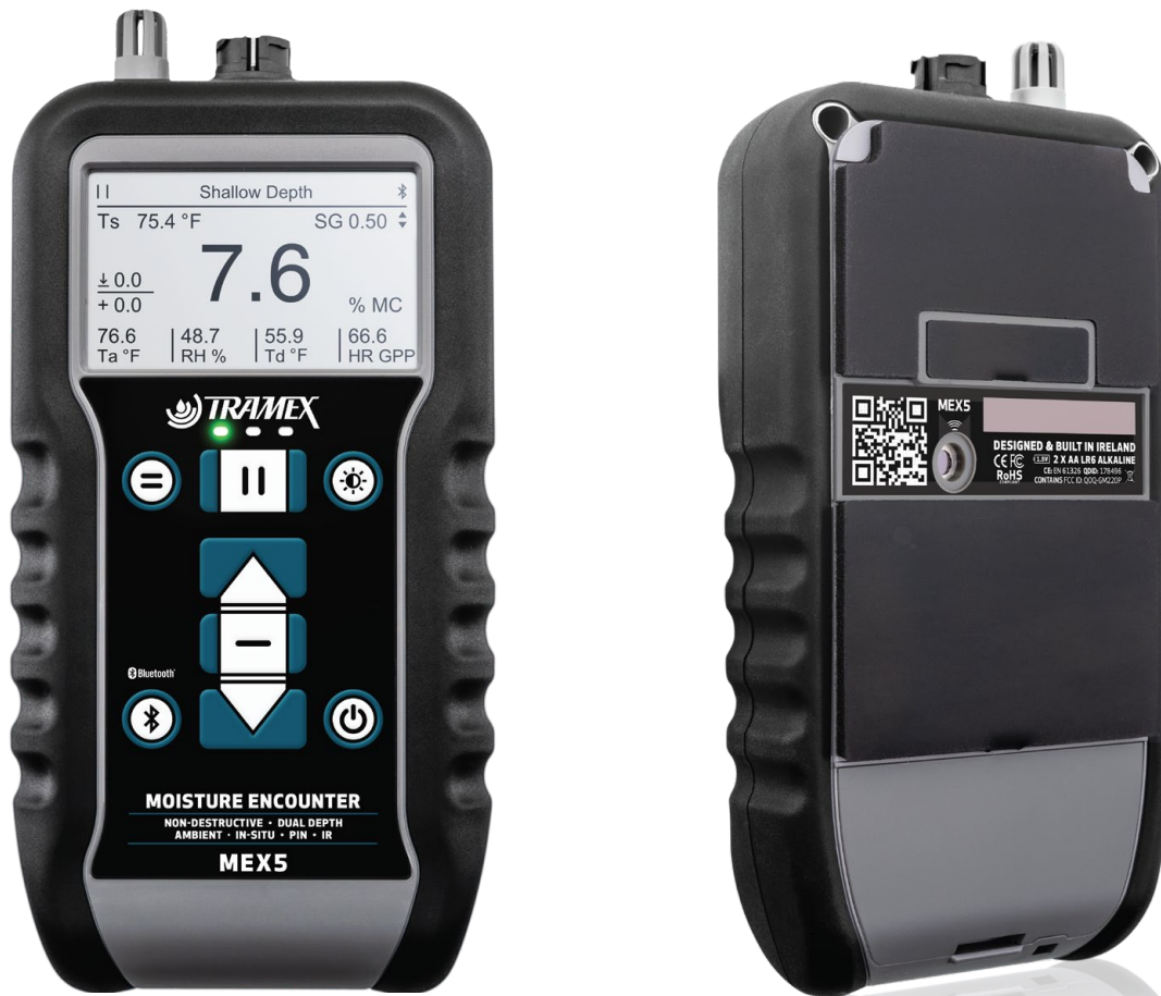
Product Order Code: MEX5

The Tramex Moisture Encounter MEX5 is a digital Dual-Depth, non-destructive moisture meter for wood and various building materials such as drywall, roofing, plaster, tile and masonry. The Moisture Encounter MEX5 has a built-in hygrometer for ambient conditions and psychrometric values, an Infrared Surface Thermometer and also incorporates external in-situ RH probes for in-situ equilibrium RH readings, as well as Pin probes for wood, drywall, and WME readings. The MEX5 allows for 500+ wood species to be chosen, SG adjustment and automatic temperature correction for wood %MC measurement precision. Moisture test results can be visualized and Geotagged with the Tramex Meters App and turned into moisture maps, reports and charts for sharing. These individual and collective features make the MEX5 an essential and indispensable asset for professionals in the wood, wood flooring, building moisture inspection and water damage restoration industries.