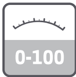
COMPARATIVE READING RANGE