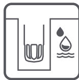
IN SITU RH, T, DP, gr/lb