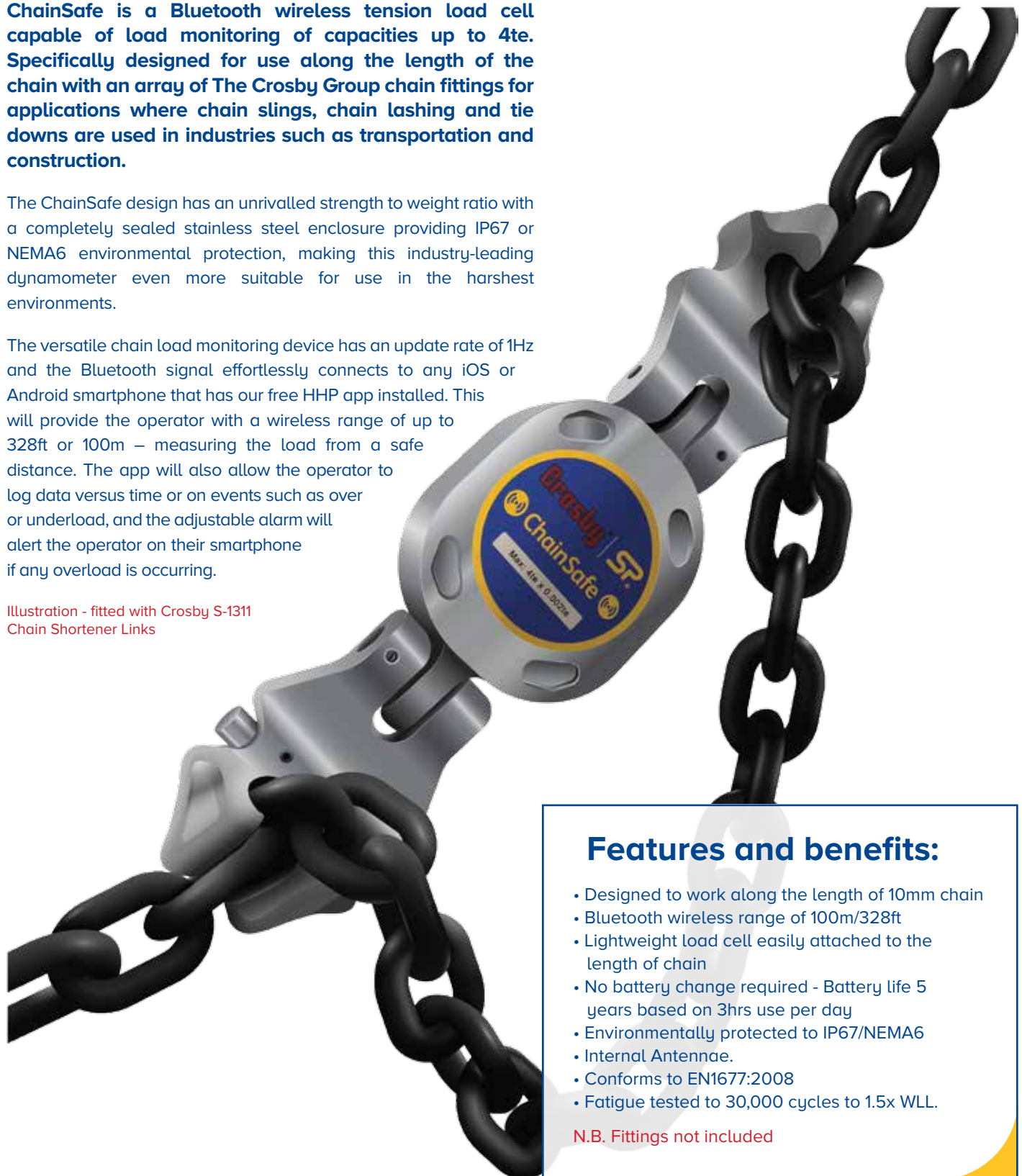
Illustration - fitted with Crosby S-1311 Chain Shortener Links

The versatile chain load monitoring device has an update rate of 1Hz and the Bluetooth signal effortlessly connects to any iOS or Android smartphone that has our free HHP app installed. This will provide the operator with a wireless range of up to 328ft or 100m – measuring the load from a safe distance. The app will also allow the operator to log data versus time or on events such as over or underload, and the adjustable alarm will alert the operator on their smartphone if any overload is occurring.