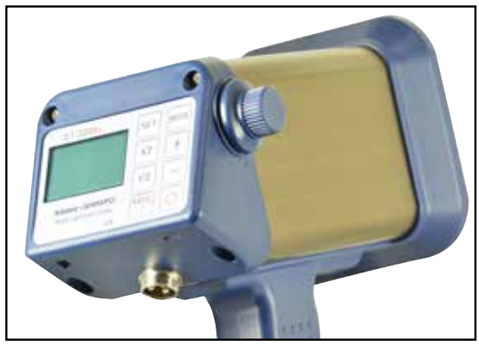
Operation Panel & Flash Adjustment Dial