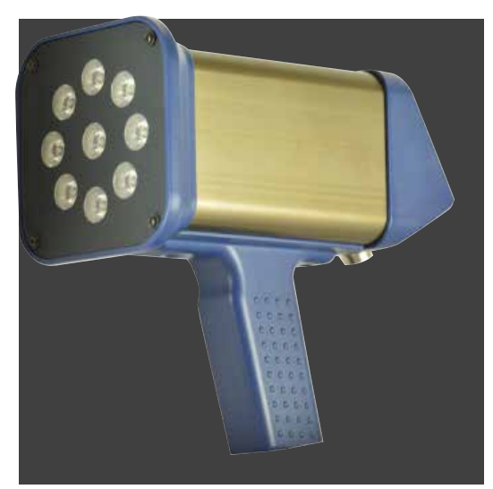
ST-320BL Black Light LED Stroboscope

The ST-320BL is designed for speed and frequency measurements in the printing, packaging, textile, automotive, cable, mining, steel, chemical, optical and medical industries in various applications.