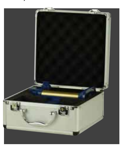
ST-320BL in Included Metal Carrying Case