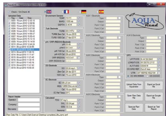
AquaLink and Google Earth screen shots