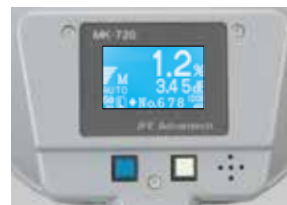
Inlaid composite image for this photo