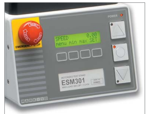
Digital controller contains a backlit LCD screen with menu choices for ease of setup and operation