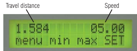
Optional integrated travel indication

The ESM301 is shown in a typical configuration with Series BG digital force gauge and G1008 film & paper grips