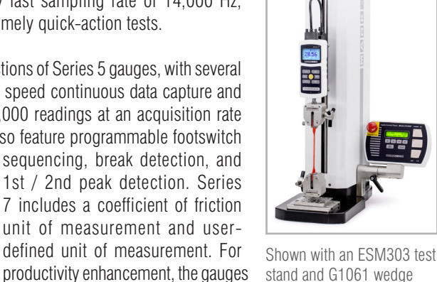
stand and G1061 wedge grips

the completion of break detection, averaging, external trigger, and 1st / 2nd peak detection.