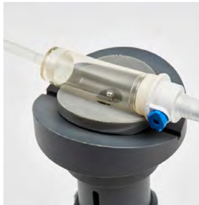
FH4-1: Measuring in tight spots

FH4-Wire sensor is indispensable for testing turbine blades where the wall thickness can be determined against a wire inserted into the cooling holes.