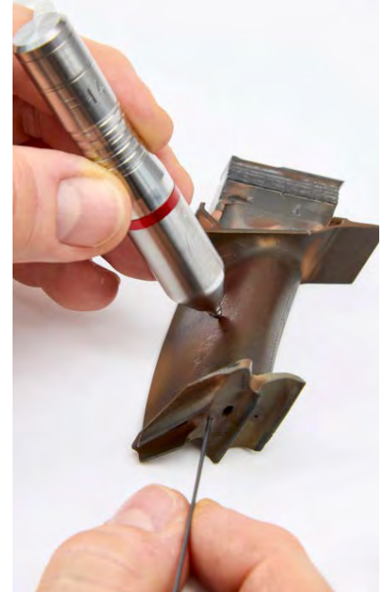
FH4-WIRE: Measuring turbine components