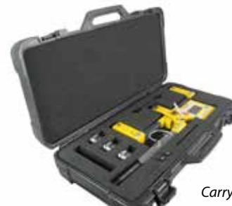
Carry case included

Dillon also manufactures highly accurate electronic and mechanical dynamometers and crane scales.