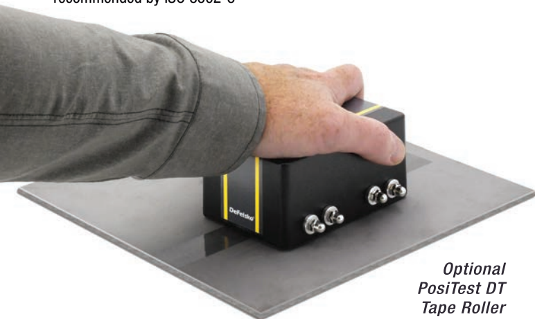
Optional PosiTest DT Tape Roller

Conforms to ISO 8502-3, AS 3894.6, US Navy PPI 63101-000