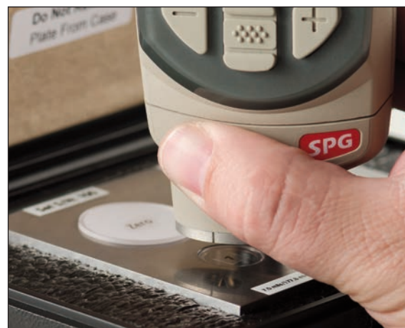
Shown with PosiTector SPG (not included)

A metal shim and glass zero plate are included with every PosiTector SPG