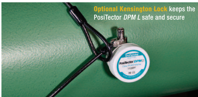
Optional Kensington Lock keeps the PosiTector DPM L safe and secure

Operating Range: -10° to 60° C (14° to 140° F)