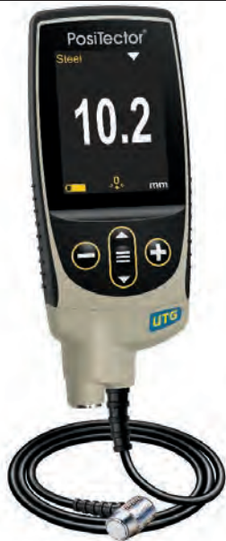
PosiTector UTG M1