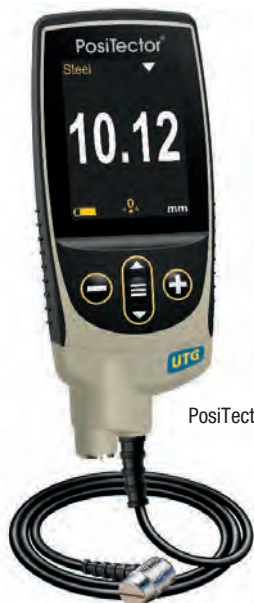
PosiTector UTG C