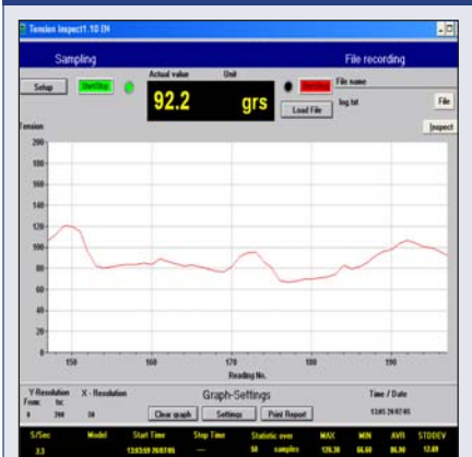
Tension Inspect Data Analysis Software (optional, part no. ETM2-SV1) is an easy-to-use program designed to display, record, graph and print data transferred from the Check-Line Digital Tension Meter.