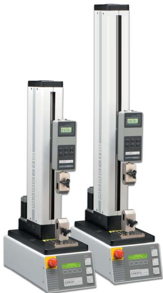
^ The ESM301 and ESM301L are shown in typical configurations with Series BG digital force gauges and G1008 film & paper grips

The ESM301 and the new ESM301L are highly configurable motorized test stands for tension and compression testing applications up to 300 lb (1.5 kN). The stands can be controlled from the front panel or via computer. The ESM301/ESM301L is engineered on a unique modular platform, allowing for "build-your-own" configurability. Features can be ordered individually at time of order or activated in the field. Integrated travel indication, overload protection, and a host of program-mable parameters makes the ESM301/ESM301L quite sophisticated, while its intuitive menu structure allows for quick, simple setup and operation. A password can be programmed to prevent unauthorized changes. With a rugged and modular design, the test stand is a compelling solution for applications in laboratory and production environments.