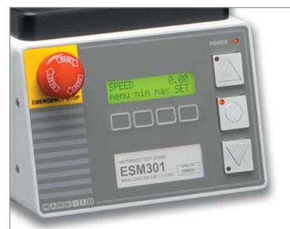
^ Digital controller contains a backlit LCD screen with menu choices for ease of setup and operation