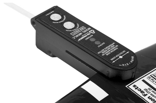
Light Mark on a Dark Web (Figure B)