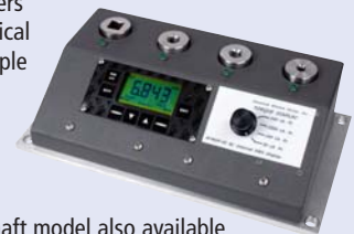
MTMMDP-4 shown, two shaft model also available

The MTM Series of torque transducers are designed to provide an economical way to measure and calibrate multiple torque tools. MTM models include an integrated display for a fully integrated tester.