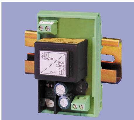
115 VAC converter (Model DPM501)