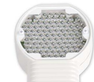
96 LED Array never needs replacement