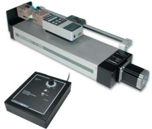
The ESMH is shown in a peel testing application, with Series BG digital force gauge, digital travel display, and pneumatic film & paper grips