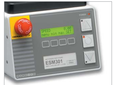
^ Digital controller contains a backlit LCD screen with menu choices for ease of setup and operation

^ The ESM301 and ESM301L are shown in typical configurations with Series BG digital force gauges and G1008 film & paper grips