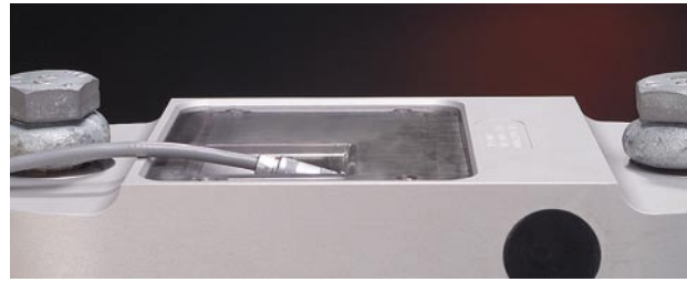
Small details improve durability. The EDxtreme features a recessed connector and embedded antenna to help prevent damage from snags that commonly disable other instruments.

Specifications and dimensional details are available from an authorized Dillon Distributor or the website at www.dillon-force.com .