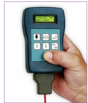
Plug-in type sensor allows one-handed operation